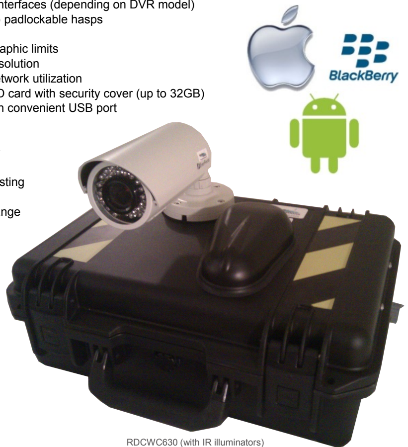
RDCWC630 (with IR illuminators)

Netarus Custom Manufacturers All Platforms. Contact Us Today For Your Next Project